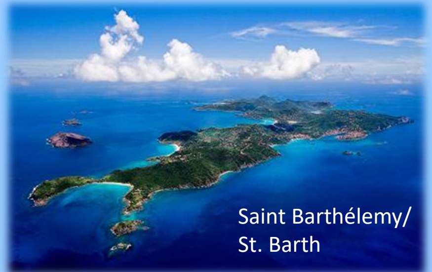
Saint Barthélemy/ St. Barth